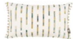
Elwood Meadow VNC3557/03 50cm x 30cm / 19.5" x 11.75"