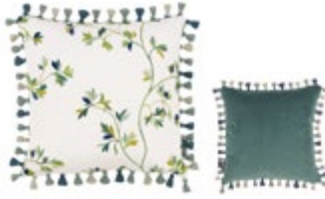
Aurea Eden VNC3556/05 40cm x 40cm / 15.75" x 15.75"