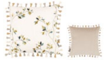
Aurea Meadow VNC3556/03 40cm x 40cm / 15.75" x 15.75"