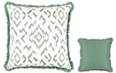
Folly Eden VNC3553/04 55cm x 55cm / 21.75" x 21.75"