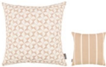
Parterre Blush VNC3554/04 50cm x 50cm / 19.5" x 19.5"