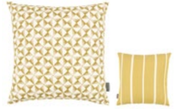
Parterre Husk VNC3554/03 50cm x 50cm / 19.5" x 19.5"