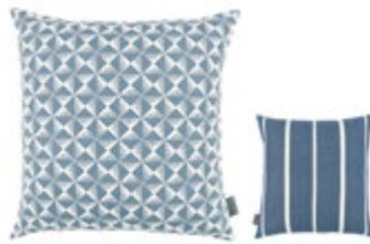
Parterre Cornflower VNC3554/02 50cm x 50cm / 19.5" x 19.5"