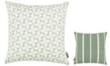
Parterre Spearmint VNC3554/05 50cm x 50cm / 19.5" x 19.5"