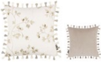
Aurea Calico VNC3556/01 40cm x 40cm / 15.75" x 15.75"