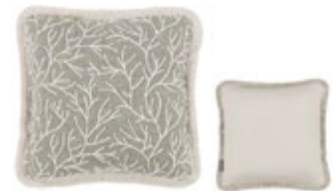
Cerelia Meadow VNC3559/03 40cm x 40cm / 15.75" x 15.75"