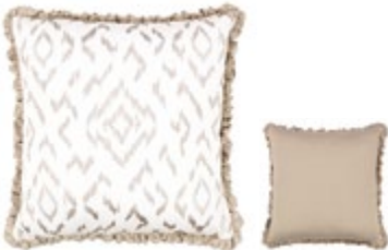
Folly Calico VNC3553/01 55cm x 55cm / 21.75" x 21.75"