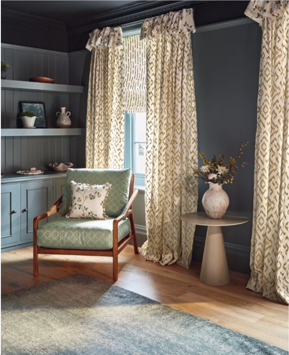
Page 10 – DRAPES: Folly Husk, BLIND: Elwood Meadow, ARMCHAIR: Twyford Marjoram, CUSHION: Aurea Meadow, RUG: Marka Verdigris Page 11 – DRAPES: Fiora Blush, BLIND: Cereia Meadow, THROW: Arden Sundown