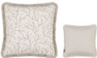
Cerelia Calico VNC3559/02 40cm x 40cm / 15.75" x 15.75"