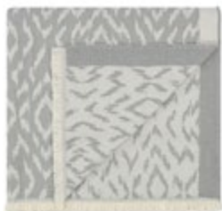
Folly Plume THV3566/01 140cm x 210cm / 55" x 82.75"