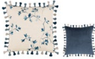
Aurea Cornflower VNC3556/02 40cm x 40cm / 15.75" x 15.75"