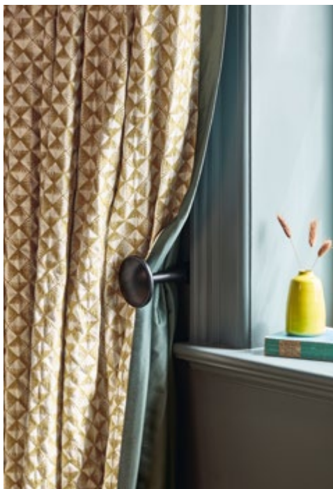
Page 6 – DRAPES: Aurea Saffron, BLIND: Parterre Blush, SOFA: Dorney Putty, RUG: Sudare Jewel, THROW: Arden Sundown, POUFFE: Rio Blackberry, CUSHIONS: Aurea Saffron, Rio Flame, Pico Marsala Page 7 – DRAPES: Elwood Saffron, Parterre Husk