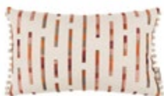
Elwood Saffron VNC3557/04 50cm x 30cm / 19.5" x 11.75"