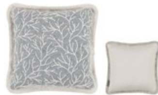
Cerelia Baltic VNC3559/05 40cm x 40cm / 15.75" x 15.75"