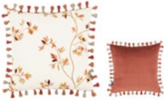
Aurea Saffron VNC3556/04 40cm x 40cm / 15.75" x 15.75"