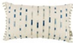
Elwood Cornflower VNC3557/02 50cm x 30cm / 19.5" x 11.75"