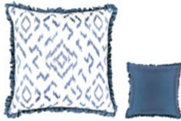
Folly Cornflower VNC3553/02 55cm x 55cm / 21.75" x 21.75"