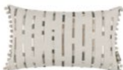
Elwood Birch VNC3557/01 50cm x 30cm / 19.5" x 11.75"