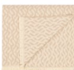
Arden Putty THV3568/01 140cm x 210cm / 55" x 82.75"