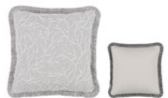
Cerelia Cirrus VNC3559/04 40cm x 40cm / 15.75" x 15.75"