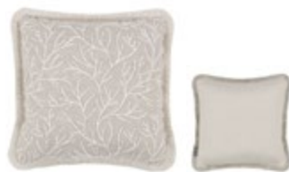
Cerelia Birch VNC3559/01 40cm x 40cm / 15.75" x 15.75"