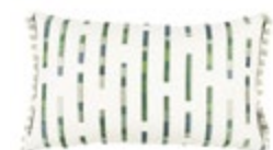
Elwood Eden VNC3557/05 50cm x 30cm / 19.5" x 11.75"