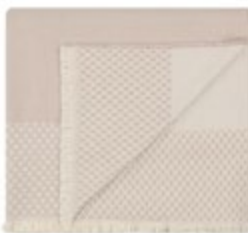
Lea Putty THV3567/01 140cm x 210cm / 55" x 82.75"