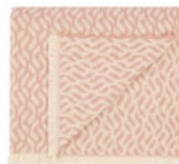
Arden Sundown THV3568/02 140cm x 210cm / 55" x 82.75"