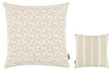
Parterre Birch VNC3554/01 50cm x 50cm / 19.5" x 19.5"