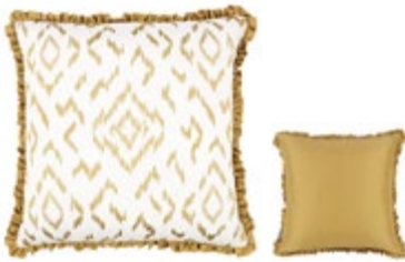
Folly Husk VNC3553/03 55cm x 55cm / 21.75" x 21.75"

Abloom cushions feature elegant embroidered florals and modern patterns, with the exciting addition of ruffles and trimmings.