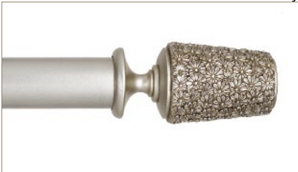
Burnished Silver Daisy