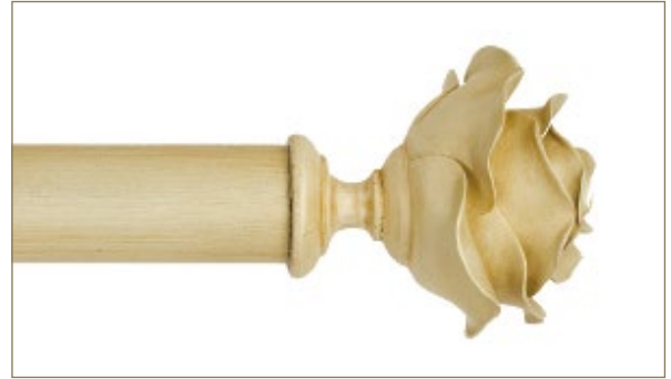
Golden Pearl Rose