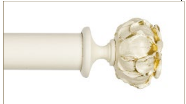
Cream Gold Peony