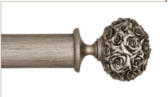
Dark Pearl Posy