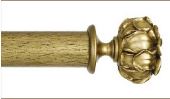
Antiqued Gold Peony