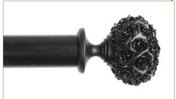
Jet Black Posy